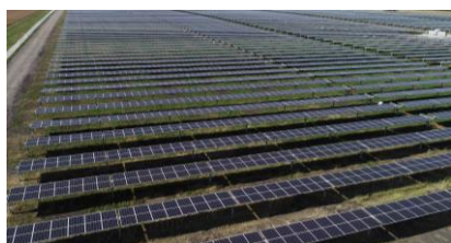
Invenergy developed Hardin Solar Energy Center, located in Hardin County, Ohio.